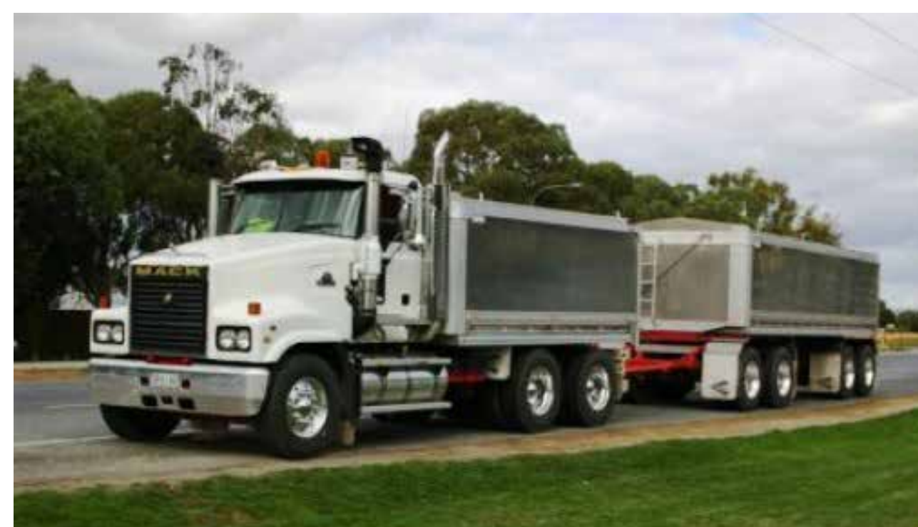
Ore truck & trailer example