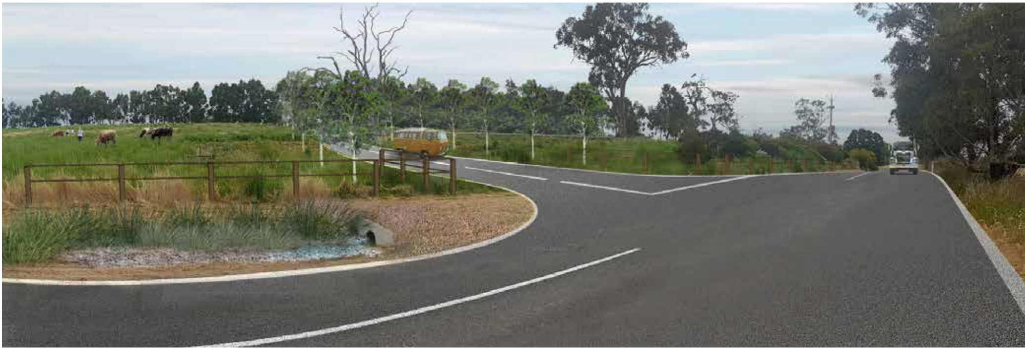
Proposed Pfeiffer Road vehicle entry

Mining vehicles will bring the gold ore to the surface where it will be loaded into ore trucks for transport to Strathalbyn for processing.