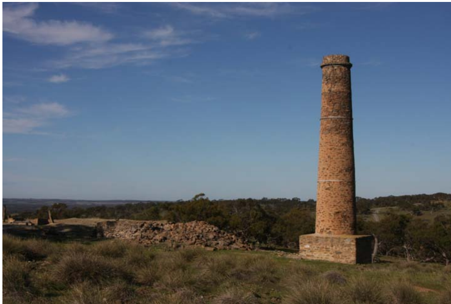
Historic infrastructure at the Preamimma Mine, South Australia

In the first year, 301,000 tonnes of ore was milled at Angas to produce 14,000 tonnes of lead-copper concentrate trucked to the Port Pirie smelter and 36,000 tonnes of zinc concentrate shipped to Asian smelters. Forecast output for 2009 is 16,000 tonnes of lead-copper concentrate and 45,000 tonnes of zinc concentrate.