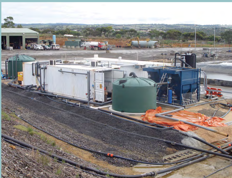
Improvements in the RO water treatment process continue to progress

treatment methods and proposed upsizing treatment. Forecasts and possible solutions will be confirmed in the coming months. Confirmation has been received from the Alexandrina council that increased flows can be accommodated and suitable alternate strategies are in place to support extra disposal.